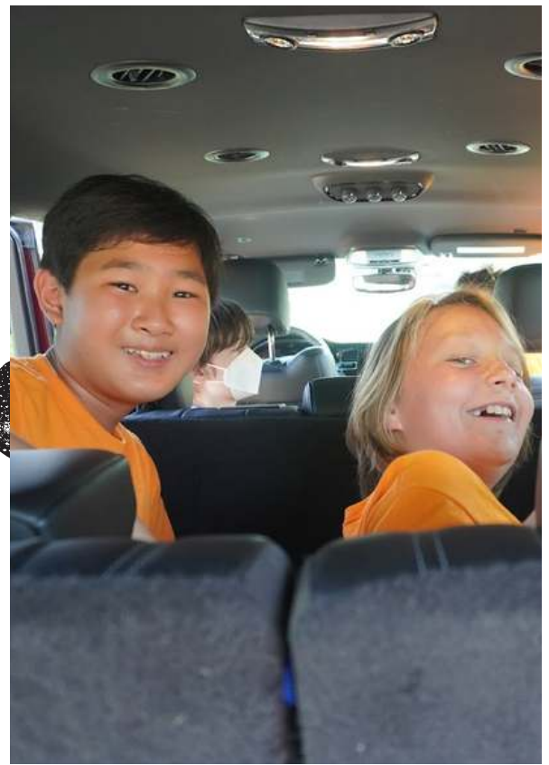
Riding in the car to our field trip