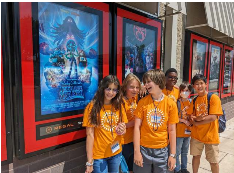
Checking out the movie poster before going in

Overall, the film was not that good and didn't live up to our expectations, and completely ruined the Kraken. Our collective rating is a solid 2/5. Thank you for your time.